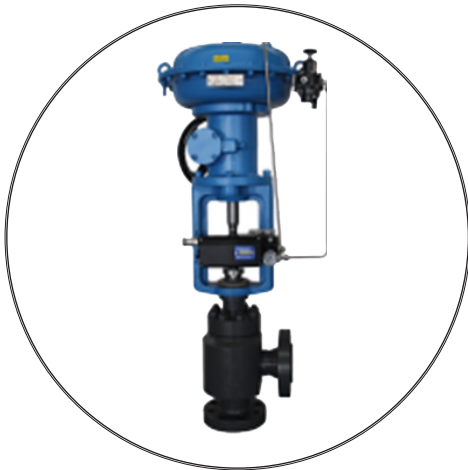
Severe Service Control Valve