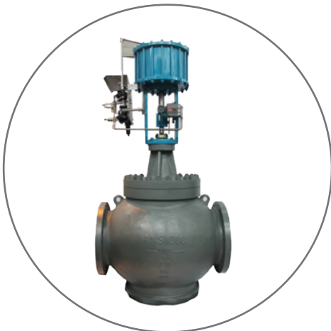
Conventional Control Valve